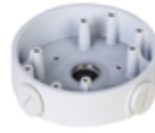
PFA139 Junction Box