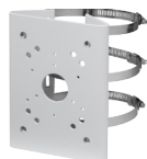
PFA150 Pole mount