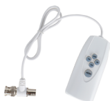
PFM820 UTC Controller