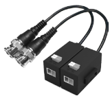
PFM800-E Passive HDCVI Balun