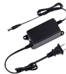
PFM320 12V 2A Power Adapter