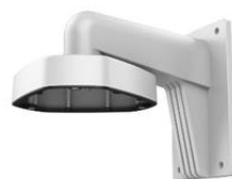
DS-1273ZJ-DM25 Wall mount