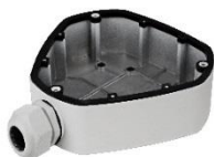
DS-1280ZJ-DM25 Junction box