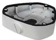
DS-1281ZJ-DM25 Inclined ceiling mount