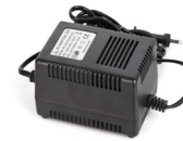
AC24V/3A Power Adapter