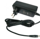
DC12V/3A Power Supply